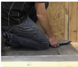
Install Chloraloy allowing for upturns