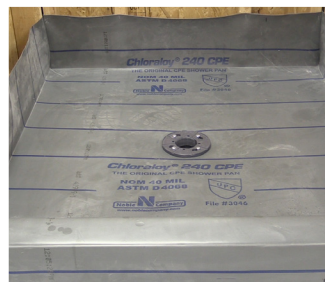
Completed in minutes

Visit our website for complete in-depth instructions, diagrams, and how-to videos on all Noble products.