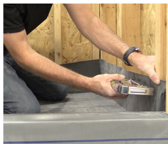
Fold corners and fasten upturns to studs