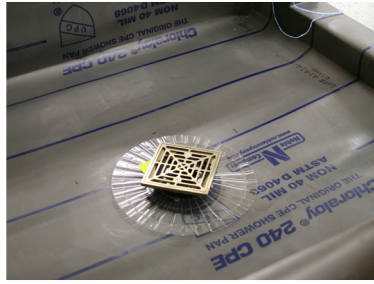
Installed in a full mortar bed method shower with Chloraloy® shower pan liner.