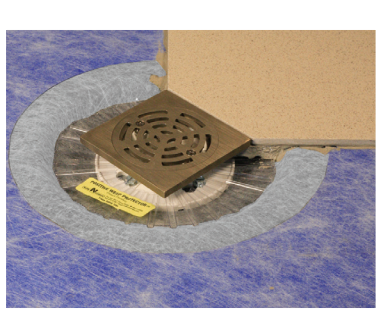
Installed in a thin-bed method shower with NobleSeal<sup>®</sup> TS waterproofing membrane, NobleFlex Drain Flashind<sup>®</sup>, and Positive Weep Protector<sup>™</sup>.