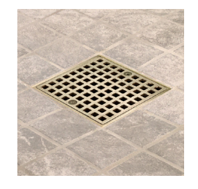
Brushed Golden Nickel #864 PVC | #964 ABS