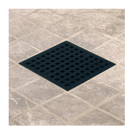
Flat Black #865 PVC | #965 ABS

Visit our website for complete in-depth instructions, diagrams, and how-to videos on all Noble products. www.noblecompany.com