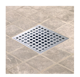
Chrome #861 PVC | #961 ABS