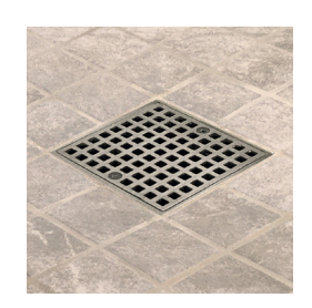
Brushed Nickel #862 PVC | #962 ABS