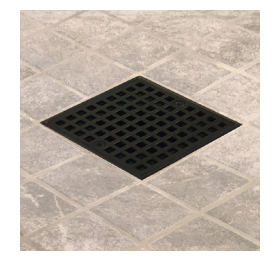
Oil Rubbed Bronze #863 PVC | #963 ABS