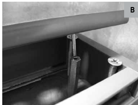
Installation of stand-off pins into end of Linear Drain base. Installation of Tile Top Strainer pins into stand-offs.