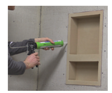
Insert Niche, caulk, and tile

Visit our website for complete in-depth instructions, diagrams, and how-to videos on all Noble products.