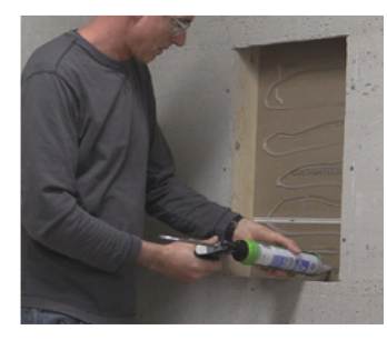
Apply silicone to backing