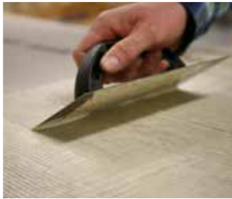
Apply bonding agent