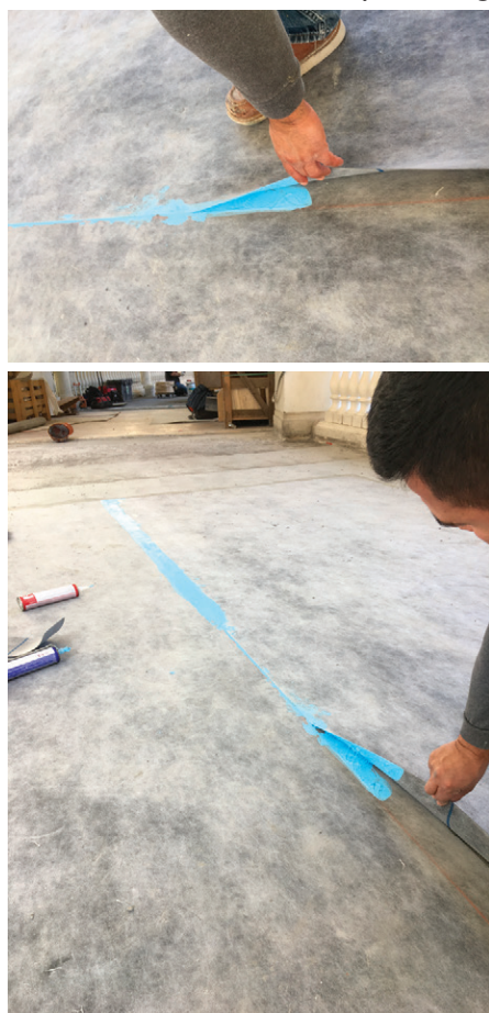
A marine-grade sealant is used for seaming, drain details, and terminations.

T Nick's legacy of quality has put the company in a unique consultative position with general contractors, as well as providing