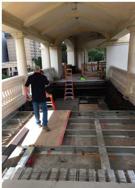
Be sure membranes in question are specifically designed, approved, or warranted as primary waterproof membranes over occupied spaces for exterior applications

The stakeholders involved with the Bellagio pool deck and people mover were well aware of all of the issues raised when this remodel project was being drawn up and put to bid.