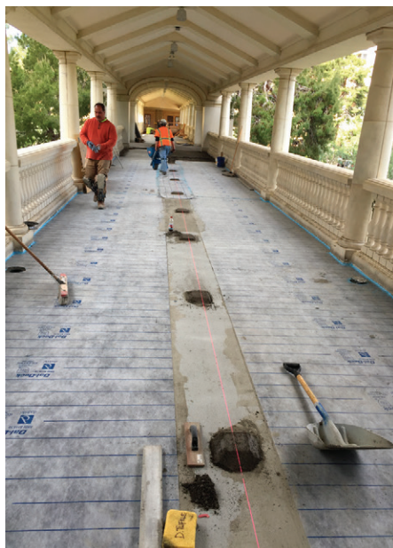
Dal-Deck, a private-label version of Noble Deck supplied by Daltile, being applied to the people mover at the Bellagio