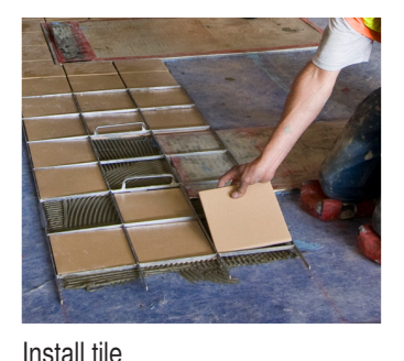
Visit our website for complete in-depth instructions, diagrams, and how-to videos on all Noble products.